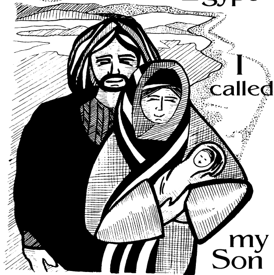
The Holy Family of Jesus, Mary, and Joseph December 30, 2007